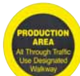
Production Area 873348