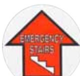
Emergency Stairs 873340