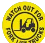
Watch Out For Fork Lift 873346