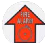
Fire Alarm 873343