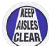
Keep Aisles Clear 873353