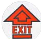
Exit Arrow 873341