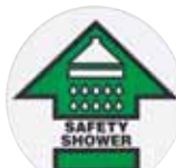
Safety Shower 873350