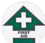
First Aid w/Arrow 873349