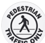
Pedestrian Traffic Only 873345