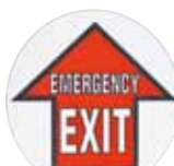
Emergency Exit 873339