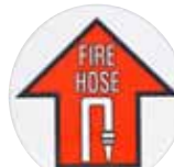
Fire Hose 873344