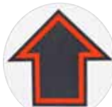
Arrow Symbol 873338