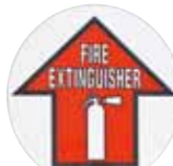
Fire Extinguisher 873342