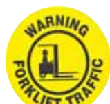
Warning Forklift Traffic 873347