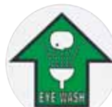
Eye Wash 873351